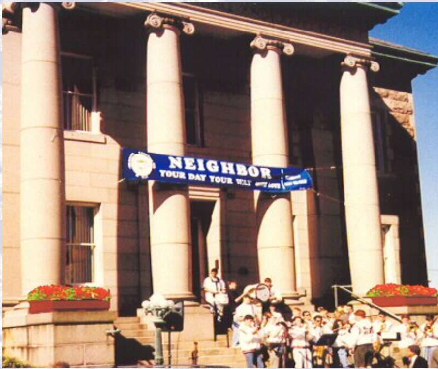
Town Hall Westerly, RI